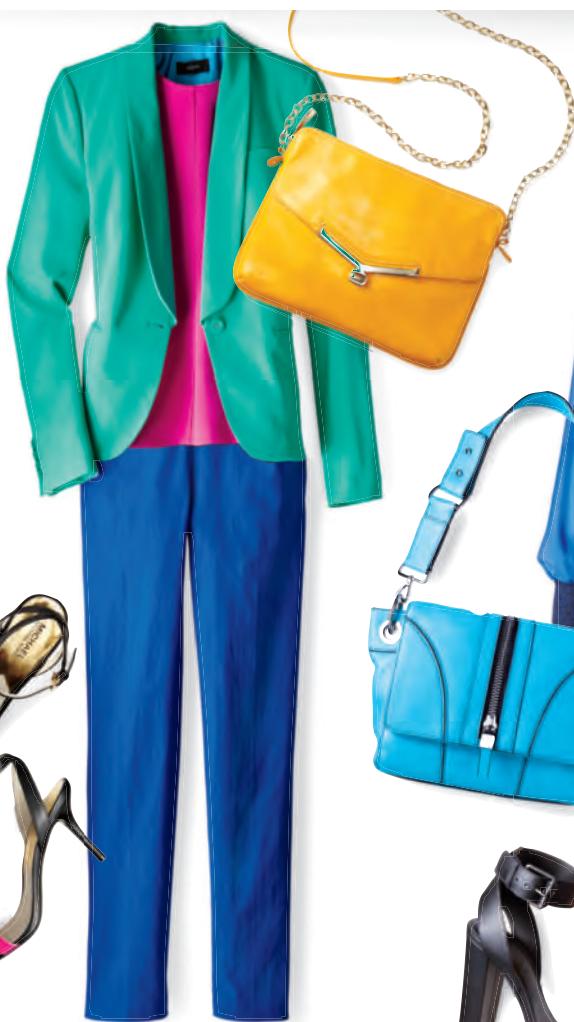
Michael Michael Kors Leather sandals, $115; at select Michael Kors Lifestyle stores.