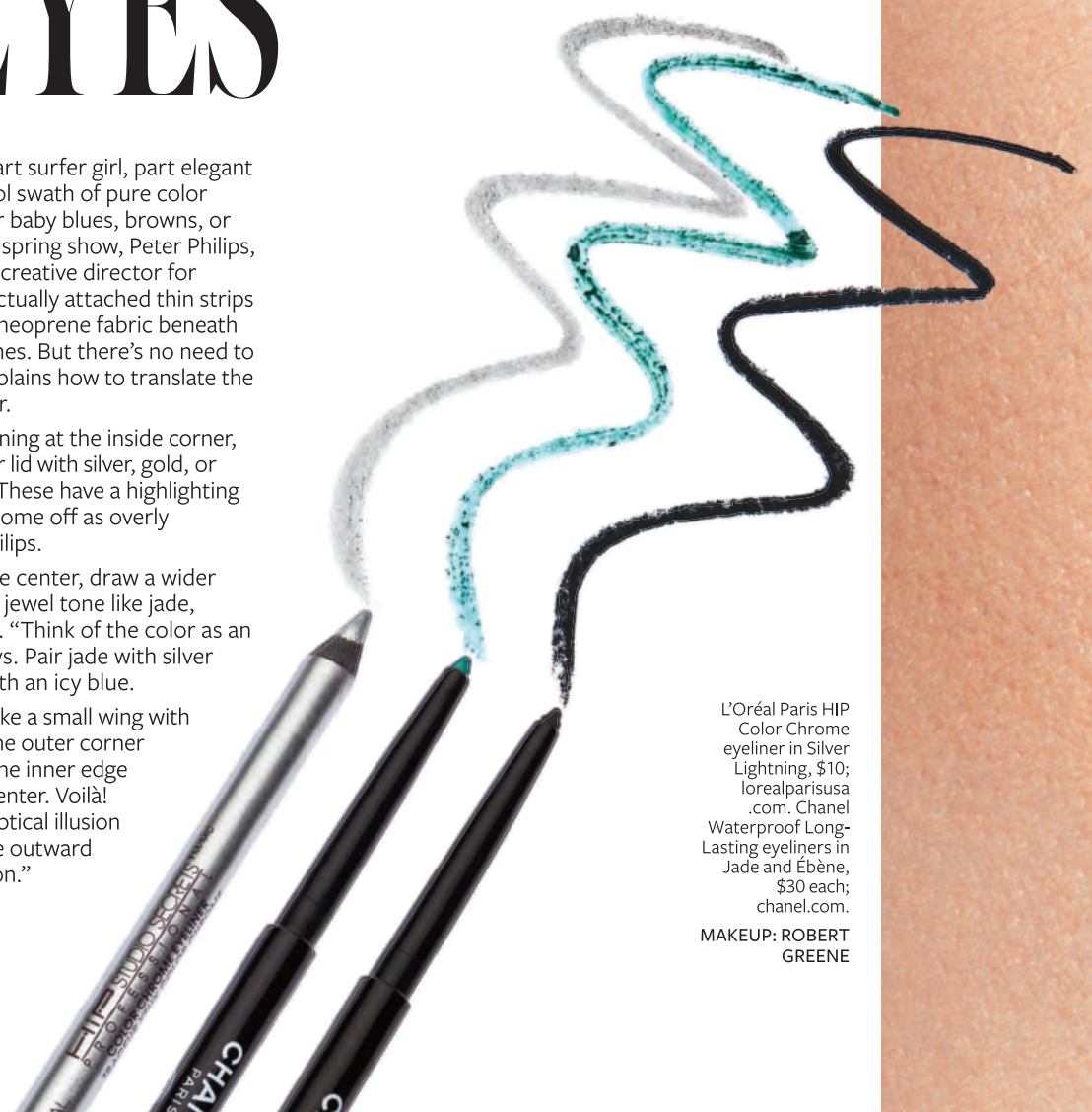
L'Oréal Paris HIP Color Chrome eyeliner in Silver Lightning, $10; lorealparisusa.com. Chanel Waterproof Long-Lasting eyeliners in Jade and Ébène, $30 each; chanel.com.

STEP THREE Make a small wing with black eyeliner at the outer corner and gently blend the inner edge into the colored center. Voilà! "This creates an optical illusion that brings the eye outward and adds dimension."