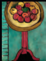
© 2012 Succession H. Matisse / Artists Rights Society (ARS), New York

Next time you're planning a dinner party, be inspired by a painting, like we were by this lush still life by Matisse, and dream up a deliciously bright tabletop. To accomplish a result as striking as the artwork, arrange pieces at each place setting in varying shades of the same color. Look for home-décor collections that come in an abundance of hues, like Mud Australia or Q Squared ( qsquarednyc.com ) for plates and Sferra or My Drap ( buymydrap.com ) for linens. And there's no need to limit yourself to the art world for ideas: Copy the colors in a vividly patterned dress (check out Diane von Furstenberg or Suno, for instance), exotic wrapping-paper prints from Kate's Paperie ( katespaperie.com ), or even your coolest supersaturated Instagrams.