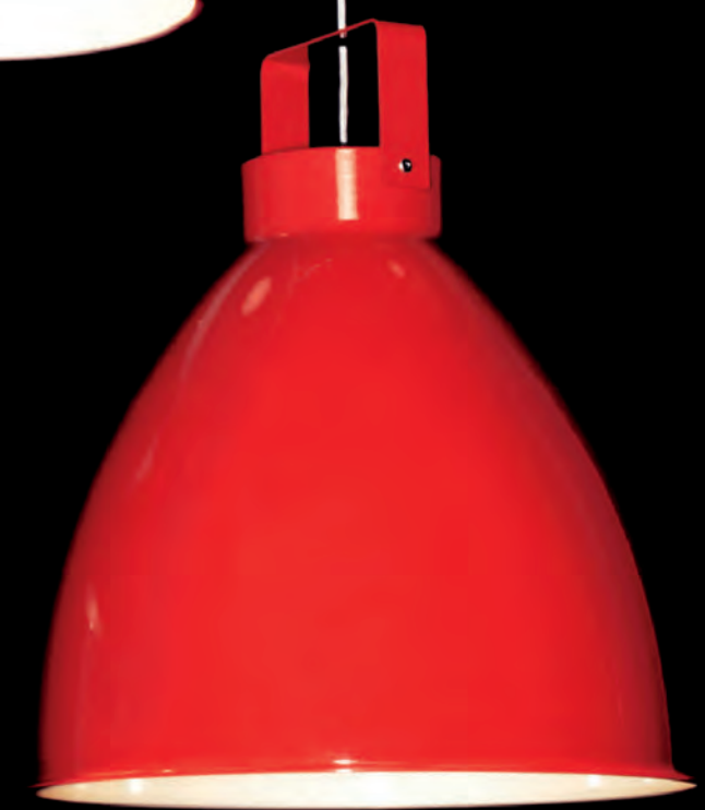
BRIGHT LIGHTS Metal Augustin pendant lights, Jielde, from $375; shopphorne.com (available in 17 colors).