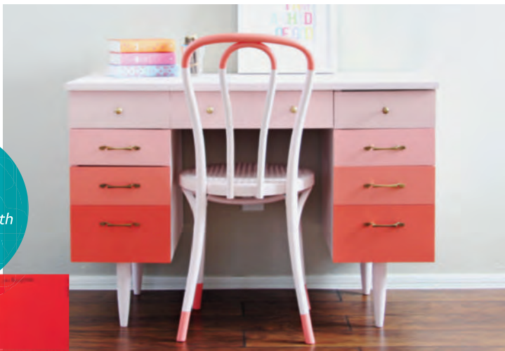
PAINT SWATCH FROM BENJAMIN MOORE

REFINISHING 101 Sand, prime, paint, and seal with fast-drying polyurethane.