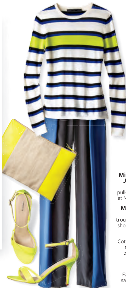
Miss Wu by Jason Wu Cashmere pullover, $295; at Nordstrom.